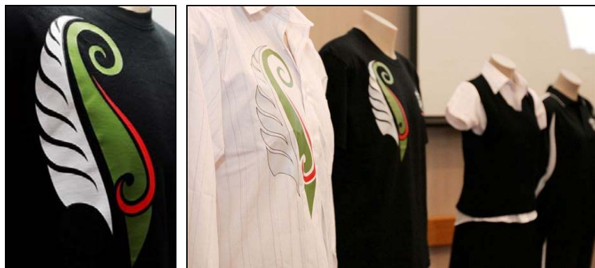
New Zealand Paralympic Team Uniform