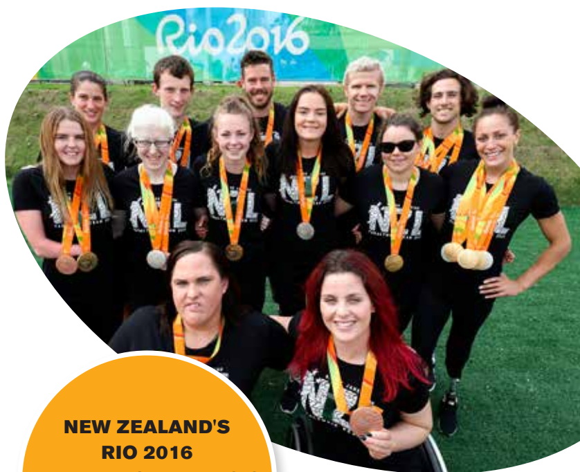
NEW ZEALAND'S RIO 2016 PARALYMPIC MEDALLISTS

It is vital that following a Paralympic Games campaign a review is completed to ensure the ongoing success and evolution of medal winning New Zealand Paralympic Games Teams. As such PNZ completed an extensive review consulting with all Games Team members and other key personnel. The findings of this review have positively informed our future planning for PyeongChang 2018 Paralympic Winter and Tokyo 2020 Paralympic Games. PNZ looks forward to once again, creating Paralympic Games Teams that Paralympians and support staff are proud to be part of as they were in Rio 2016.