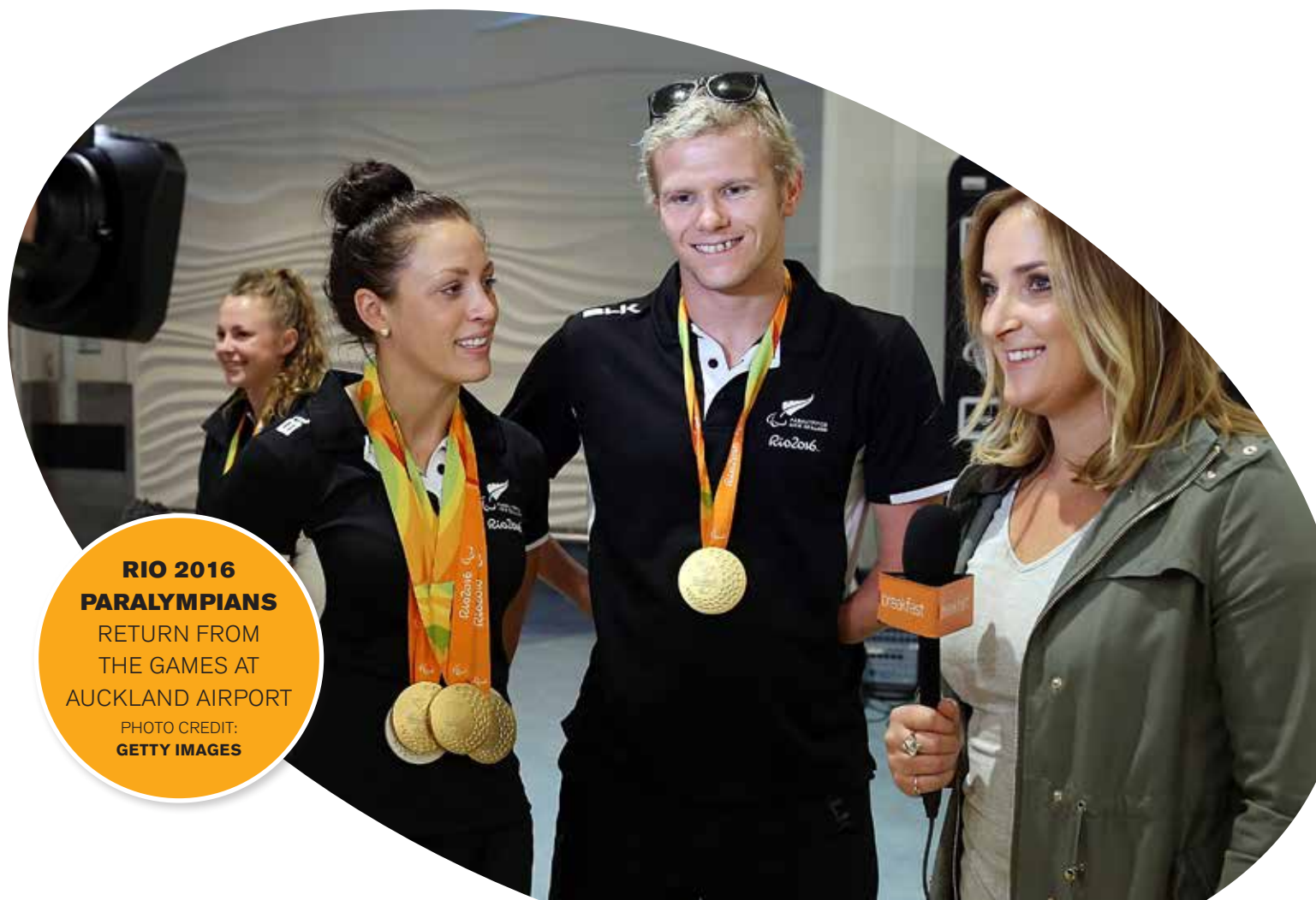
RIO 2016 PARALYMPIANS RETURN FROM THE GAMES AT AUCKLAND AIRPORT

Recognising their ongoing passion and commitment to supporting New Zealand's Paralympians, PNZ would like to especially thank gaming, trust and grant partners: Pub Charity, New Zealand Racing Board, The Lion Foundation, NZ Community Trust and First Sovereign Trust.