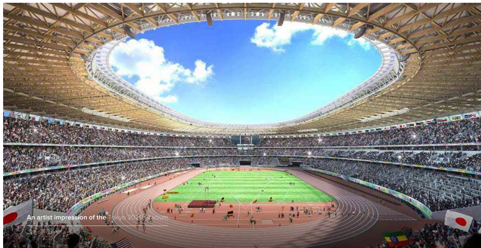
An artist impression of the Tokyo 2020 Stadium

The Paris 2024 Paralympic Games will be held from 4 – 15 September 2024.