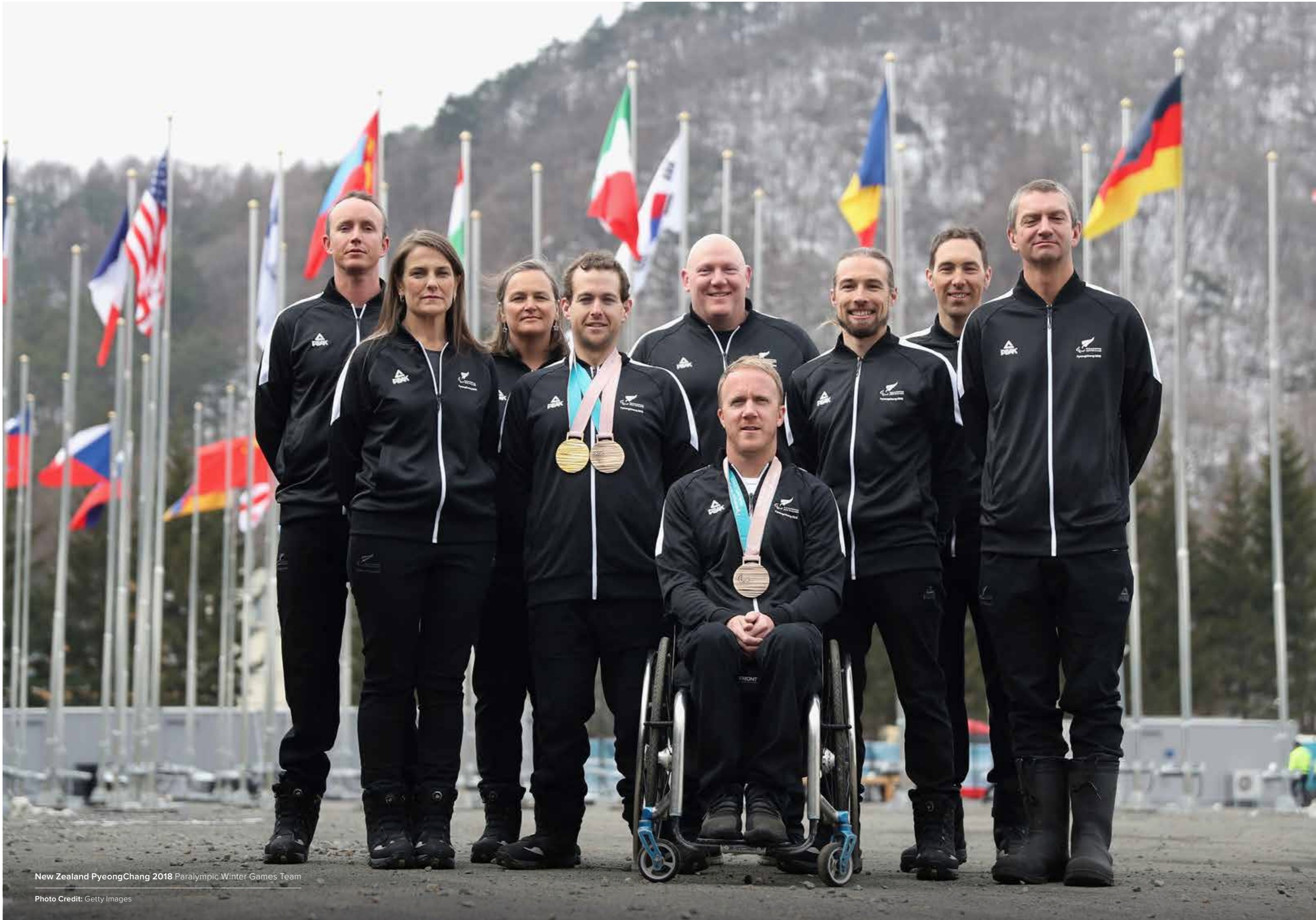
New Zealand PyeongChang 2018 Paralympic Winter Games Team