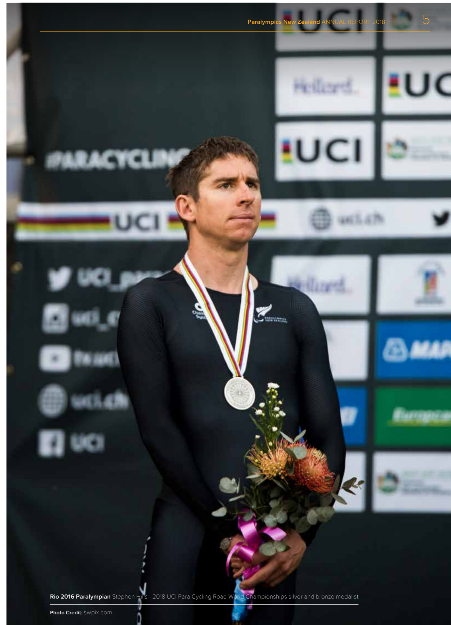
Rio 2016 Paralympian Stephen Hills - 2018 UCI Para Cycling Road World Championships silver and bronze medalist