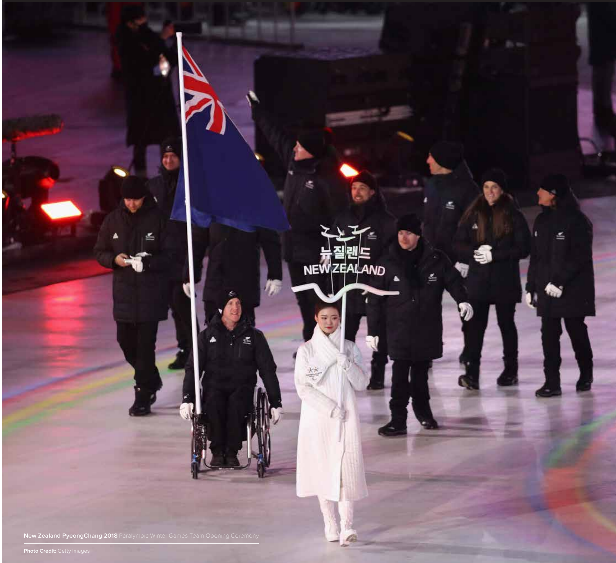
New Zealand PyeongChang 2018 Paralympic Winter Games Team Opening Ceremony