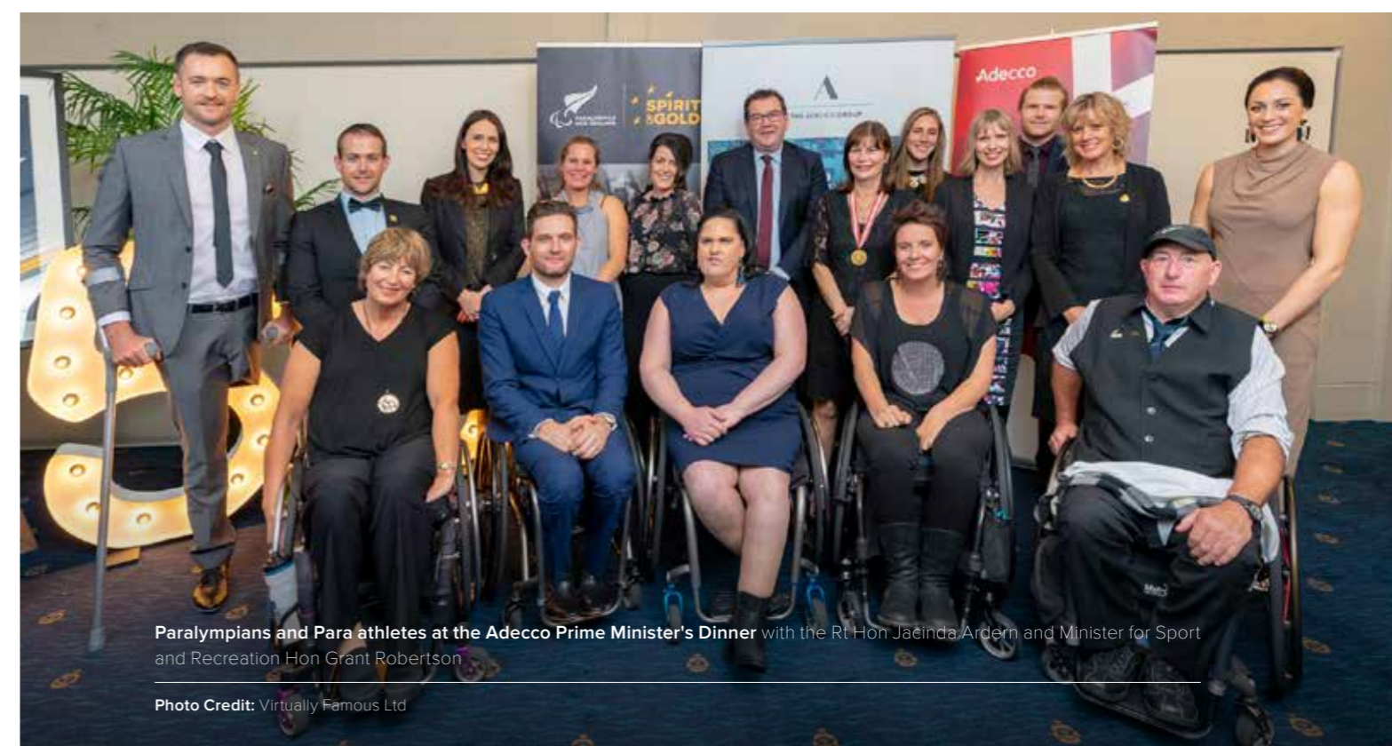
Paralympians and Para athletes at the Adecco Prime Minister's Dinner with the Rt Hon Jacinda Ardern and Minister for Sport and Recreation Hon Grant Robertson

A special thanks to our gaming, trust and grant partners: NZ Lottery Grants Board, The Lion Foundation, New Zealand Racing Board, NZ Community Trust, Pelorus Trust, Pub Charity, Trusts Community Foundation, Four Winds Foundation, Trillian Trust, First Sovereign, North & South Trust, Stevenson Village Trust, Mt Wellington Foundation Ltd, Blue Sky Community Trust, Southern Trust.