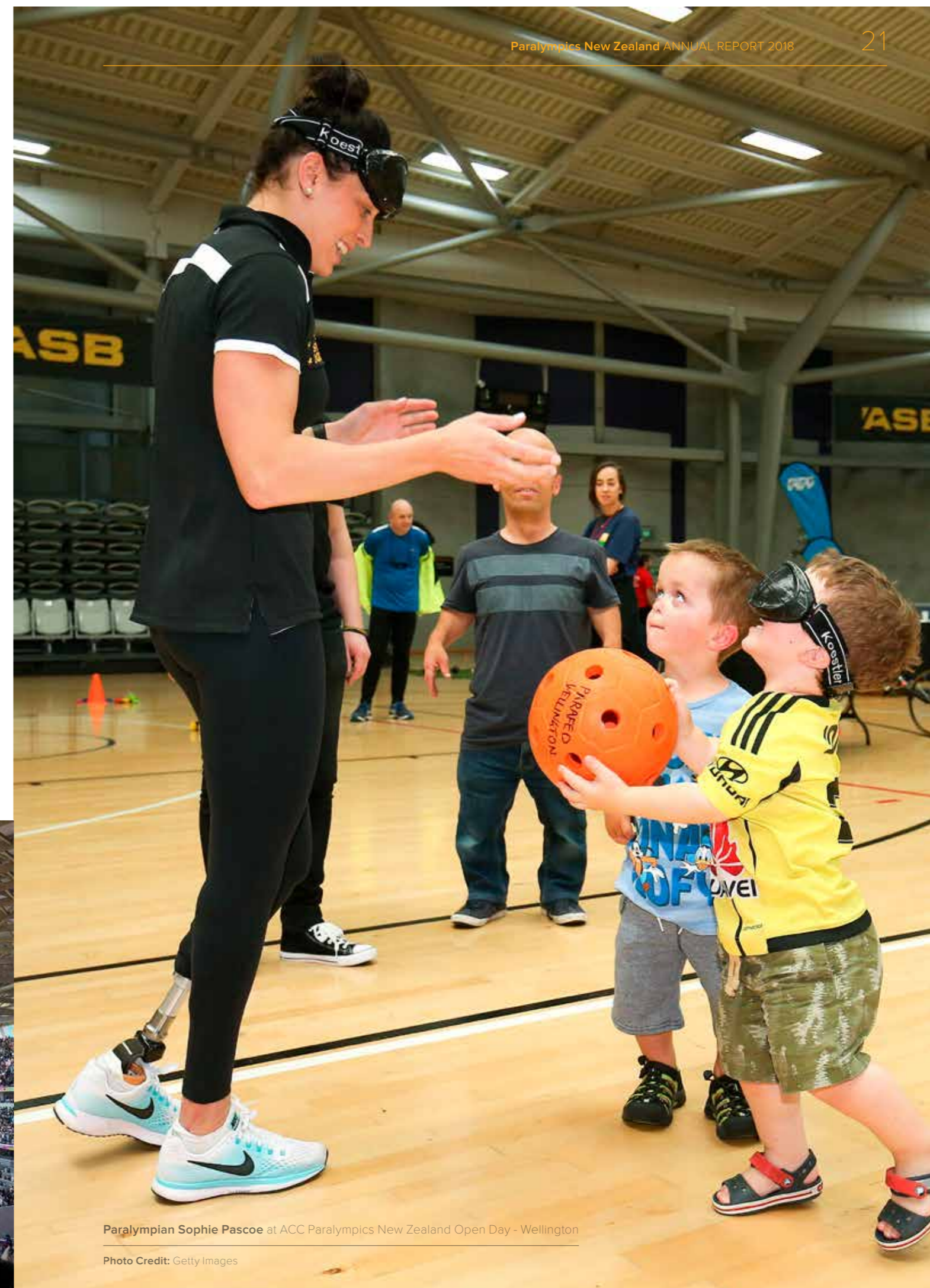
Paralympian Sophie Pascoe at ACC Paralympics New Zealand Open Day - Wellington