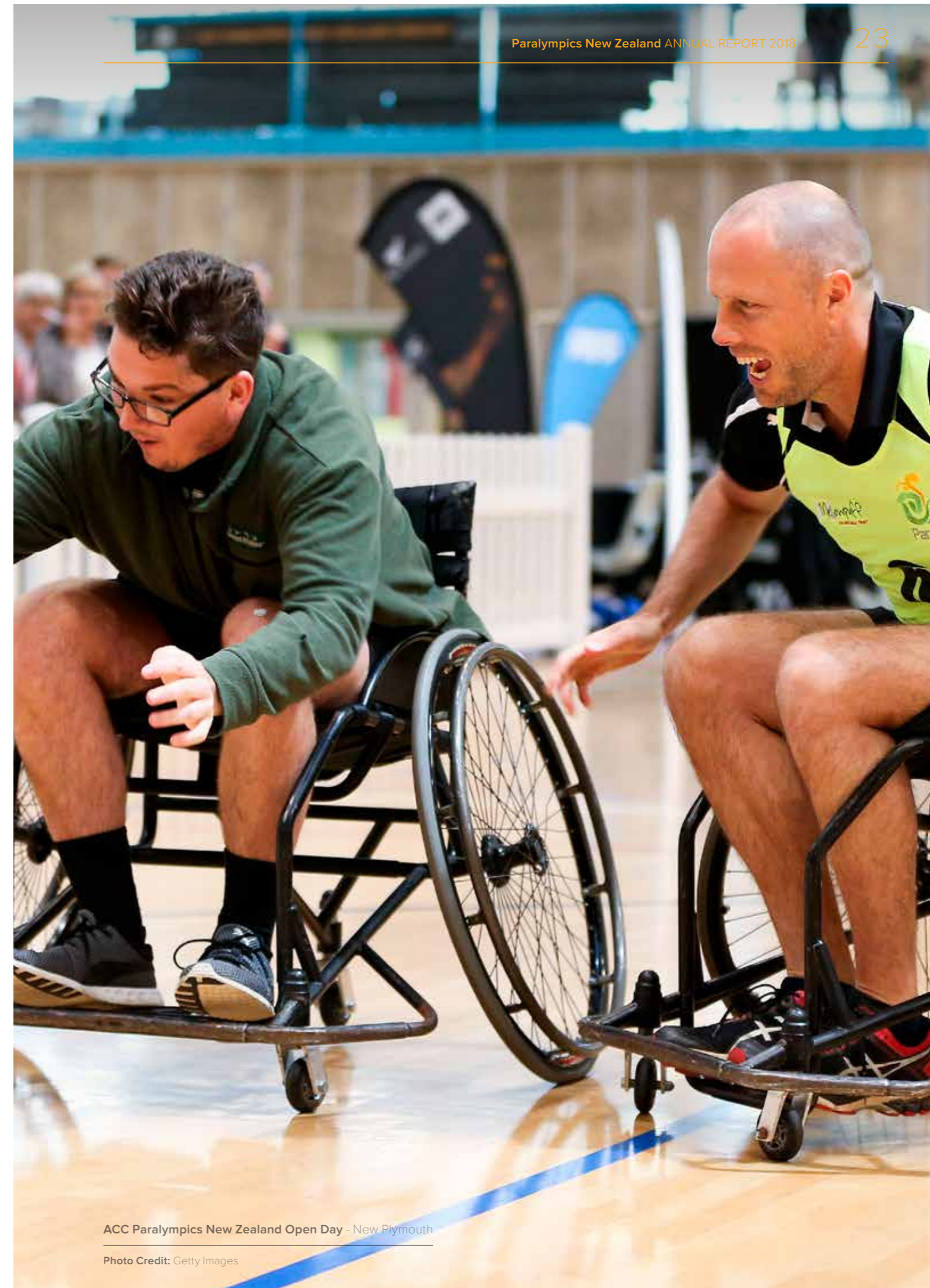
ACC Paralympics New Zealand Open Day - New Plymouth