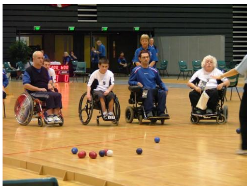
NZ Boccia Team – Boccia World Cup Christchurch 2003