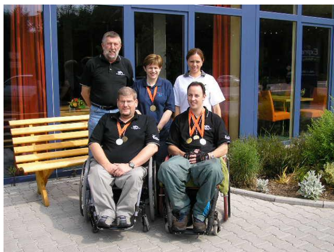
NZ Shooting Team European Tour 2004